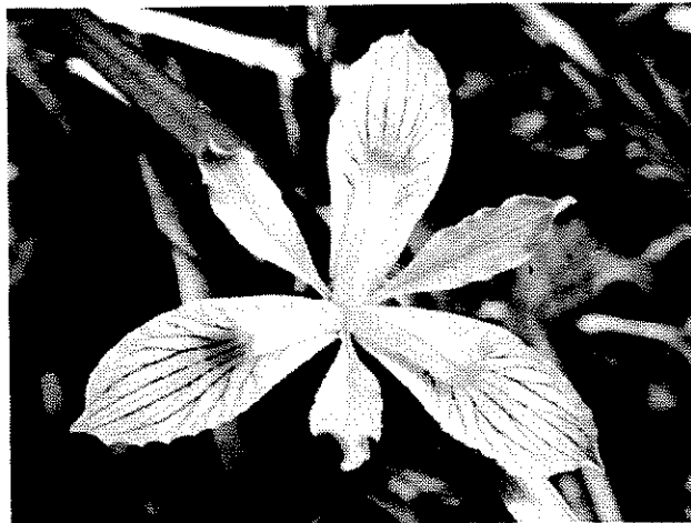
A narrow-petaled form of Iris innominata at China Flat

a more perfect bloom. With our cameras always at hand, we would assume amazing feats of contortion trying to get a more perfect shot of the more perfect flower. There were a lot of people taking pictures of people taking pictures. It was a photographer's paradise, the discovery of an I. innominata bloom with a red flush on the falls, the bi-colored violets, the calochortus, and the tiny wild roses, to name a very few. All these were photographed - carefully composing, focusing, and metering, - only to discover that there was no film in the camera! Frustration and anger! Anger that we could be so stupid, - the chance of a lifetime ruined! Oh, well, no matter. The pictures are firmly locked away in memory and who knows, they may get better with time."