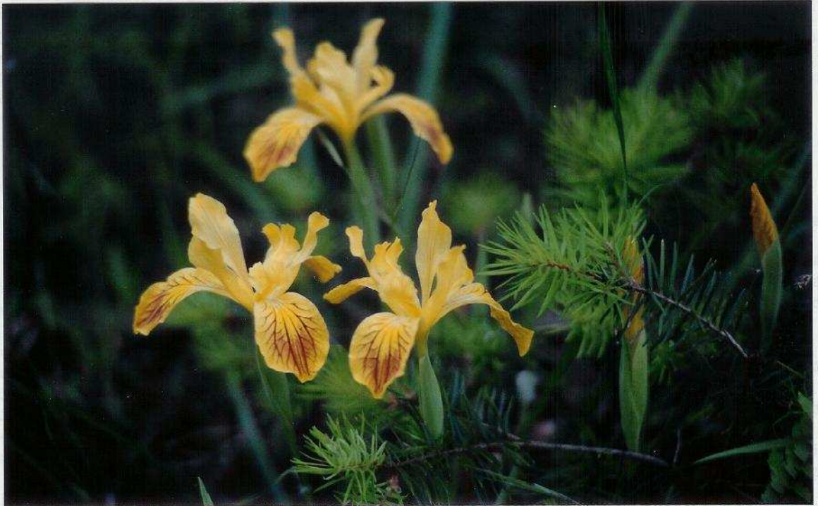
Beautifully patterned form of Iris innominata on Cow Creek Loop Road

foot or hitching a ride on the bus from time to time. Irises and other flowers were plentiful all along the way and the bus traveled just fast enough to pick up the stragglers until these hitch-hikers spotted a place where they wanted to get out and start looking again. Our "hike" ended at a wide, gently sloping field of flowers of all kinds including, of course, irises, in this case I. bracteata , a pale golden beauty. These were growing among drifts of showy pink phlox, and were surrounded with violas, daisies, silene, delphinium, purple allium, castilleja, Lewisia, and the ever-present beautiful calochortus (the "pussy ears" type), not precisely identified by our resident botanists, Wayne Roderick and Ted Kipping.