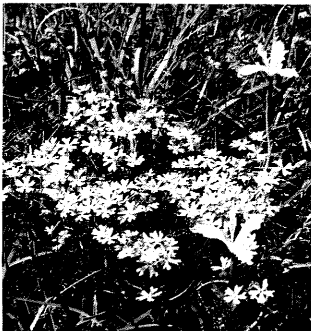
Cream-yellow flowers of Iris bracteata rising above a clump of brilliant pink phlox

We took our lunches where our fancy dictated: to the edge of the rushing stream or into the woods, and everyone felt the magic of the surroundings. Some nice plants of Dicentra oregonum were much photographed and Wayne identified surrounding plants and trees at a roadside gathering.