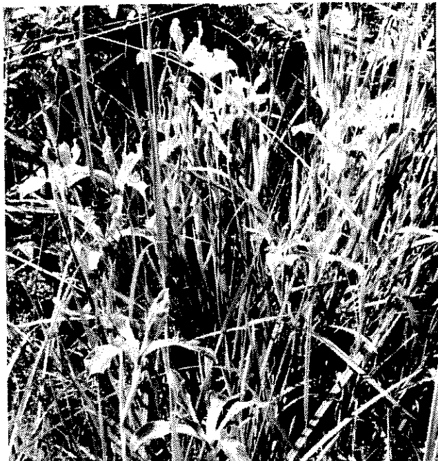
One (1) magnificent clump of I. tenax

saw some isolated, inaccessible PCN blooms along the way. And then there were many more miles of anxious perusal of both sides of the Powers-Agness road. We finally saw a single, magnificent clump of purple tenax nestled in some poison oak. One clump, however magnificent, does not a tour make! I was depressed.