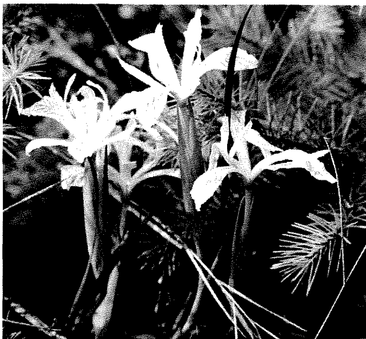
Iris chrysophylla along Cow Creek