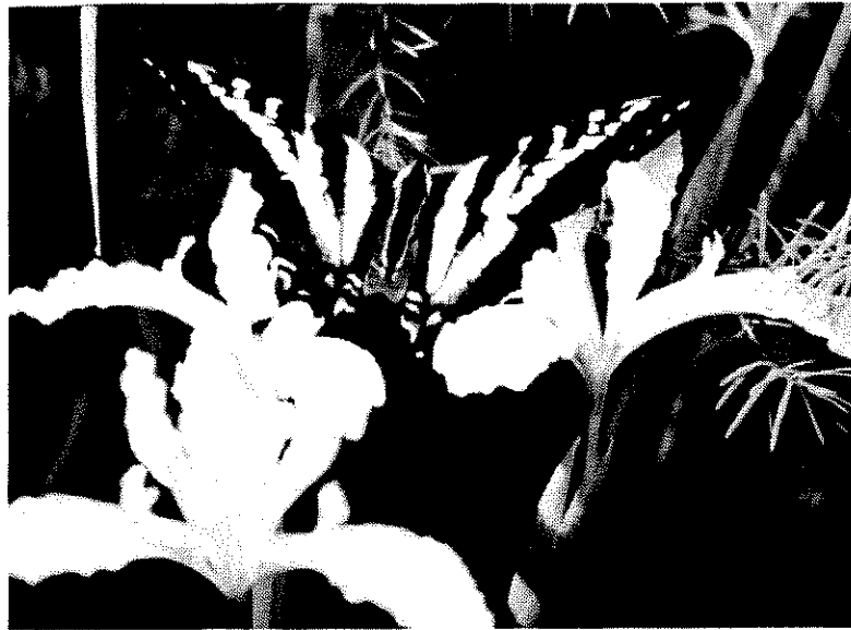
Swallowtail butterfly contemplating the pollination of I. thompsonii during our stop at Gasquet