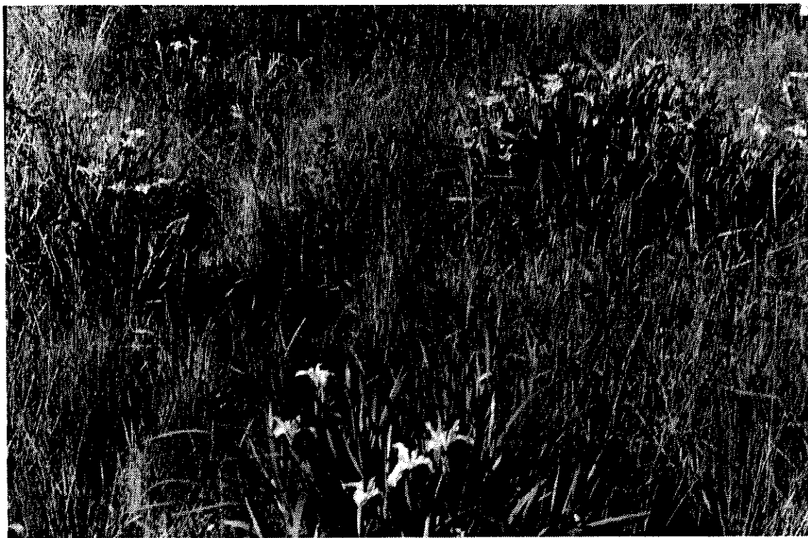
Clumps of " Iris thompsonii " in a grassy field near the town of Gasquet

A short detour at the small town of Gasquet provided a view of I. thompsonii . Here, as in many places, our idling bus parked at the side of the road and 40 or so people swarming over the landscape, stooping, squatting, kneeling, bending over, or sometimes even prone to get a closeup, or just standing and gazing at the scene, would bring a passing car to a halt with questions