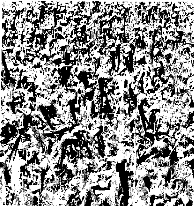
Mass of Darlingtonia californica

Here we found our first Darlingtonia californica , (pitcher plant or cobra lily), in a little bog area a few feet from where the bus had stopped. There must have been a hundred or more of these odd cobra-shaped, insect eating plants and everyone went wild snapping cameras and crowding to get a better look. Of course, we later found them by the thousands in swampy seepage slopes, not more than a hundred yards or so down the road, but that first sight was a real thrill.