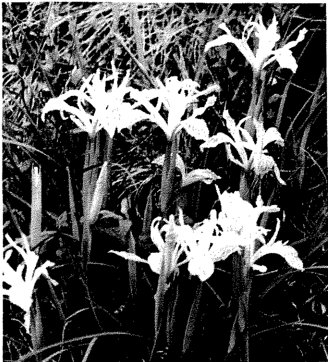
Iris chrysophylla on the last stop of the trip

Back on US 199, we continued to wend our way to Grants Pass, then north on the Interstate to the Wolf Creek turnoff, westward around Greyback Mountain. Here,