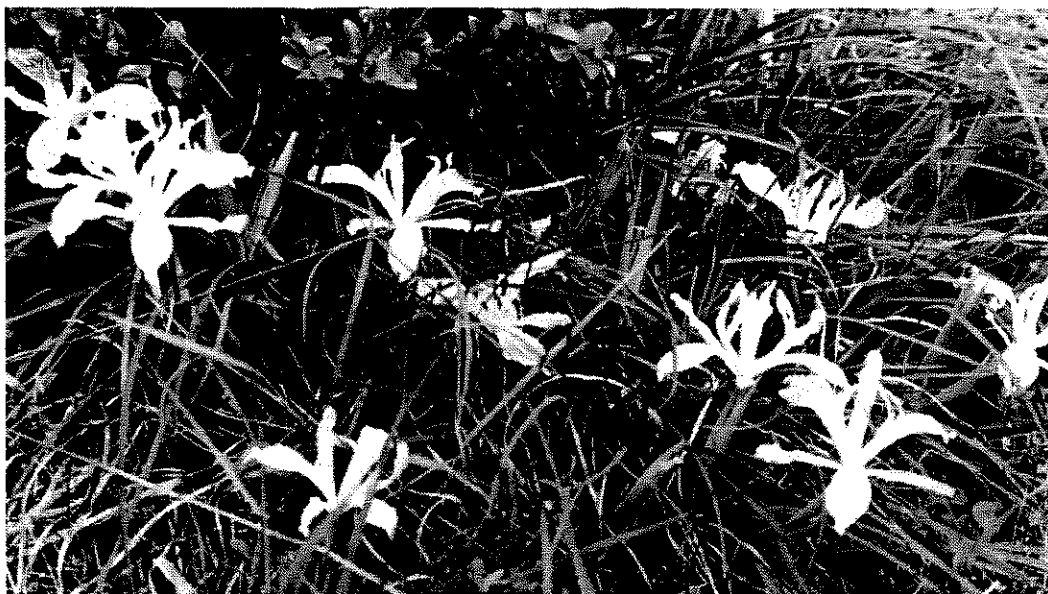
Lacy, white Iris chrysophylla on Cow Creek Loop

From there we traveled back down the road for a couple of miles, either on