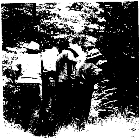
The first PCN of the trip

Saturday morning, May 13, at Roseburg, we met the participants, a few we already knew and others that we would come to know, 43 people from California and Oregon and one from New Zealand. The bus headed west on State Route 42 for Mt. Cama Summit and here we got our first glimpse of I. chrysophylla . Not a single one went unnoticed. every type of lens from wide to telephoto probed their innermost secrets. Several Camcorders were also probing the scene as hidden recesses were searched for the more bashful beauties, be they the iris or the wide assortment of flora that greeted our eyes everywhere.