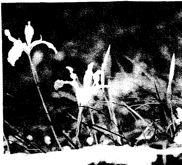
Iris innominata near China Flat

Just before Myrtle Point we headed south and passed thru the small town of Powers. Arriving at China Flat in Siskiyou National Forest, we turned up a gravel road along the side of a mountain to locate I. innominata . My main interest was IRIS, but even the most avid of the irisarians had to admire the beauty of the scene and the myraids of other spring bloom, some so tiny that it would take several blossoms to cover a dime.