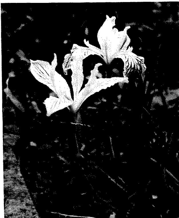
Pale yellow form of I. innominata seen near our lunch stop

At the summit of the Powers-Agness road where we stopped for lunch, we found more I. innominata , but this time in pale yellow to cream colors.