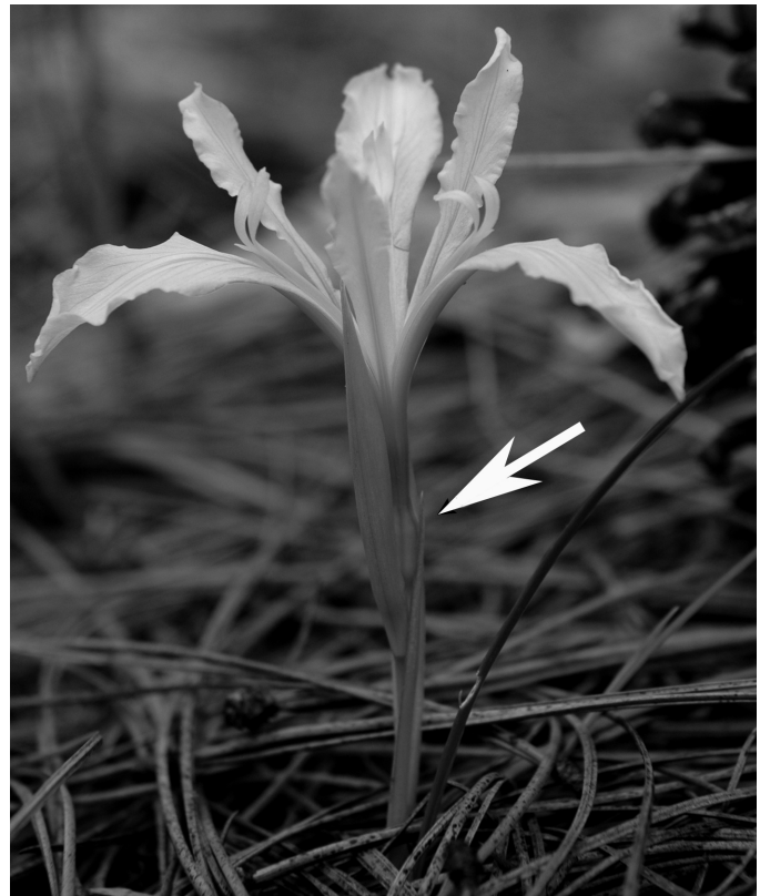
Iris hartwegii subsp. pinetorum near Greenville, California (bract-like leaf at arrow).

DNA: Deoxyribonucleic acid, whose purpose is long-term storage of genetic information within a nucleus. DNA comes in four forms, and composes double-sided chains that are twisted into spirals, hence the term 'double helix' for the shape. These long polymer chains of thousands of individual DNA molecules make up genes, which link together into even larger units, called chromosomes.