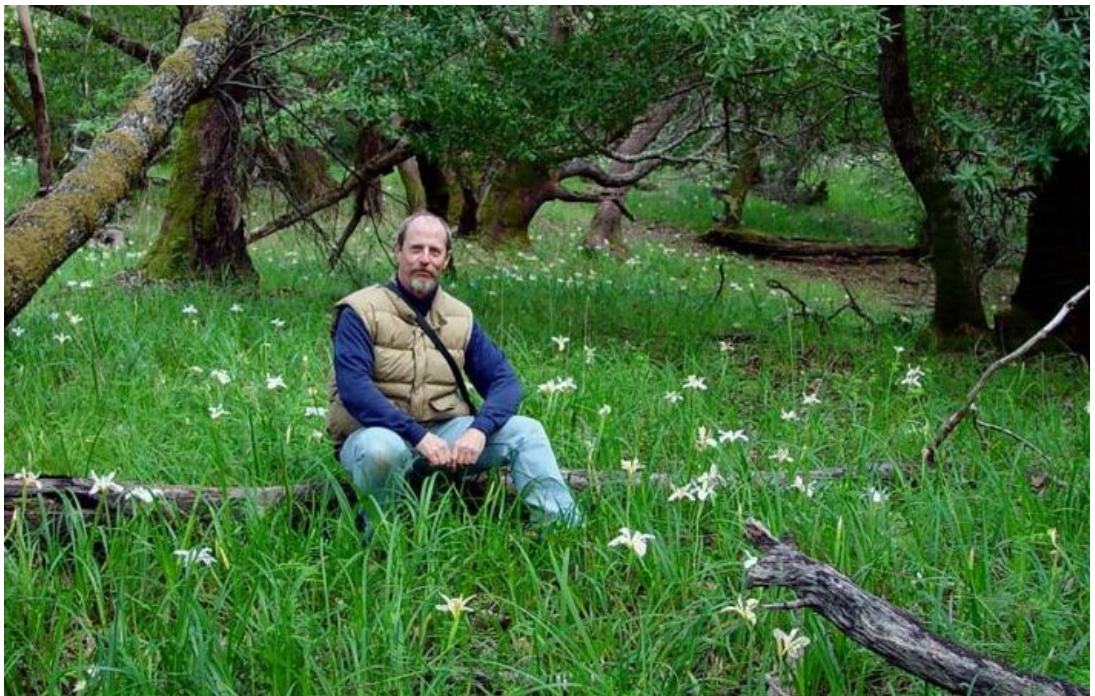
Cover photo: Iris tenax on Nicolai Mountain, OR.

Read all about his love affair with Marin iris on page 18 of this issue.