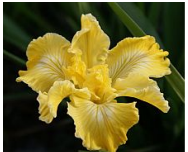
An example of the variety of plants grown from SPCNI seed