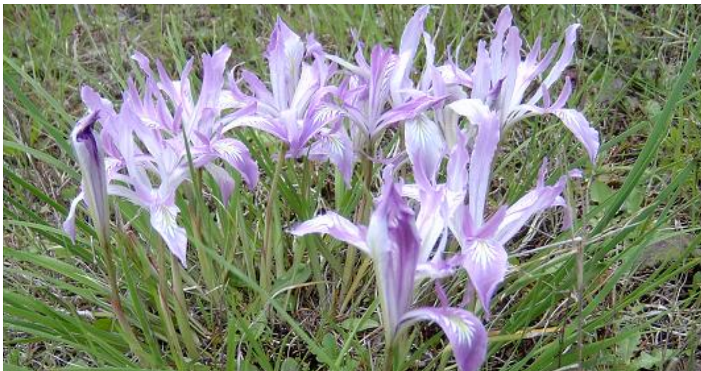
Iris x noti

Thanks to computers, and the availability of past Almanacs in scanned form, it is easily possible to search for what has been written about the Noti iris, and how it differed from other hybrids of crosses of the two parent species. Thanks to the internet, it is also possible to search for other articles written about this hybrid, including Quentin Clarkson's PhD dissertation, which described the characteristics of the hybrid that differentiate it from its two parent species.