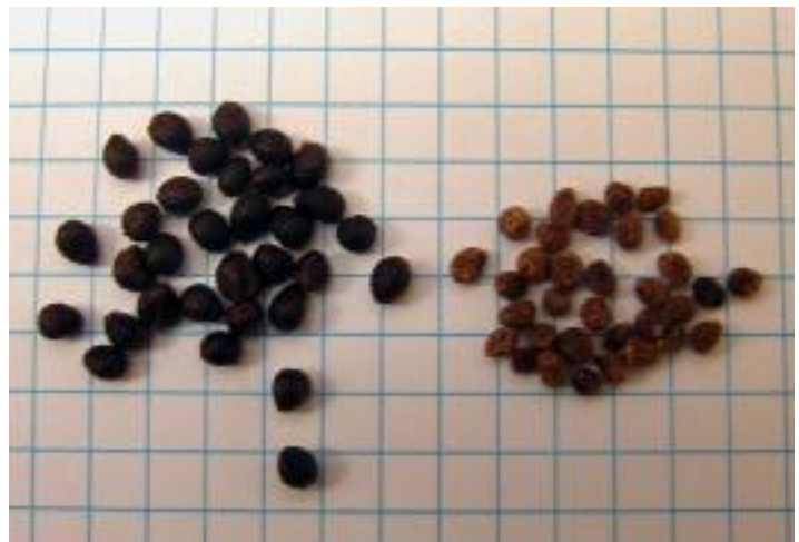
PCI 'Mendocino Blush', pre-soak on right, post-soak on left.