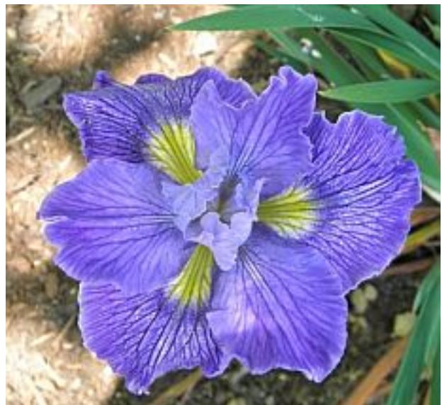
Top: Iris x noti , story page 5