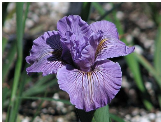
A 'Canyon Snow' x 'With this Ring' seedling from Bob Sussman