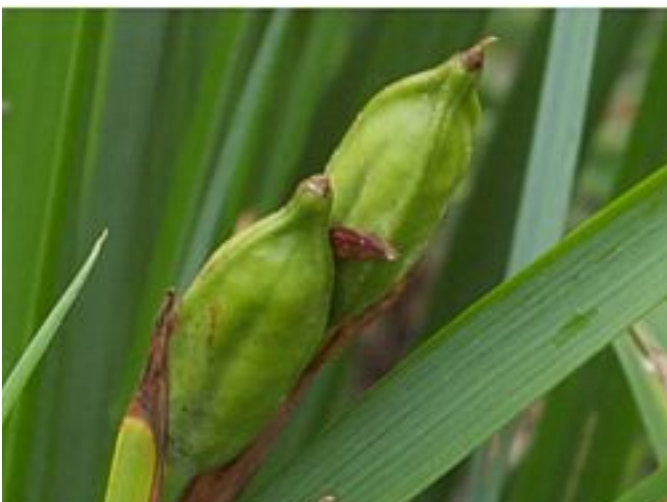
Seed pods - immature and just about right!

For seeds that will be donated to the seed exchange, be sure to label each seed envelope clearly with the species or variety, collection location if wild collected and your name. Including an estimate of the number of seeds in the envelope will earn you an extra thank you from seed exchange volunteers. Your donation is now ready to mail!