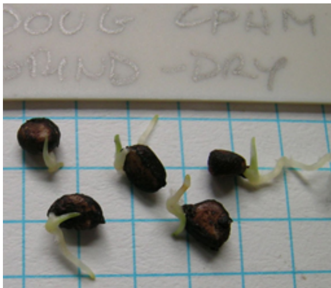
I. douglasiana germination

The seed coats began to soften and loosen from day fifteen forward. By day thirty, some seeds had loose and fragmenting seed coats; most seed coats were intact, though soft. The seed coat appears to slow water delivery to the seed. This may help the seed with a steady level of moisture uptake during intermittent rain and with irregular soil moisture. Seed coat fragments were lost as the seeds were rinsed and dried before weighing, slightly lowering the measured weight in some lots towards the end of the thirty-day period. Weight of seeds peaked around day thirty. However, most water was taken up in the first few days of soaking. Seeds with coats ground off took water up very rapidly, and reached maximum weight within one week.