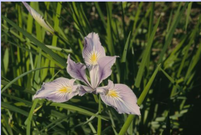
I. tenax , Lawyer, Monument Peak