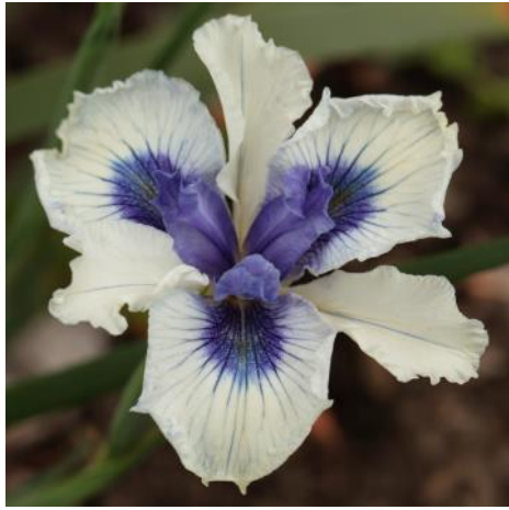
'California Born' - photo Ken Walker

Photographs of cultivars registered between 2016-2019