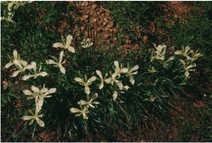
I. tenax ssp. klamathensis , Lawyer, Orleans

While gormanii is merely a variety of the species, the other yellow I. tenax is a full subspecies: I. tenax ssp. klamathensis . It demonstrates most, but not all expected characteristics of the species. A particularly unexpected trait is that it grows in a very small location in California rather than in Oregon or Washington. Lewis and Adele photographed it at this location, Orleans in northern California.