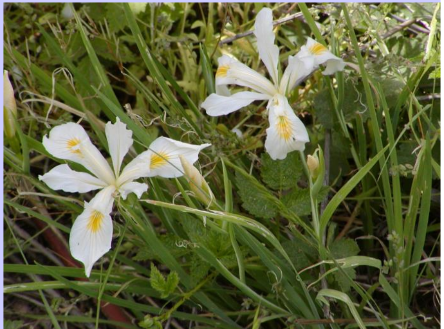
I. tenax var. gormanii, Henry Hagg Lake