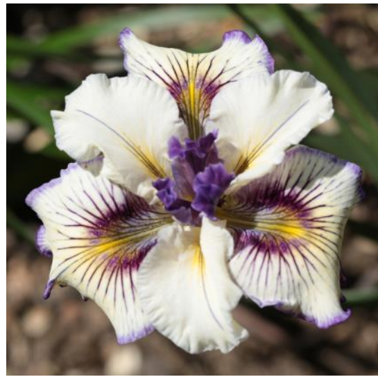
'Conga Line'