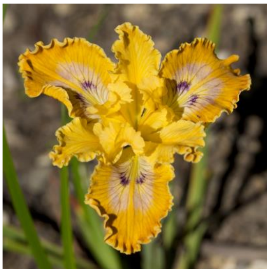
'Cheddar Cheese'