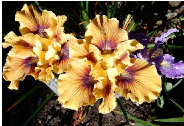
'Skara Brae' - photo Bob Seaman