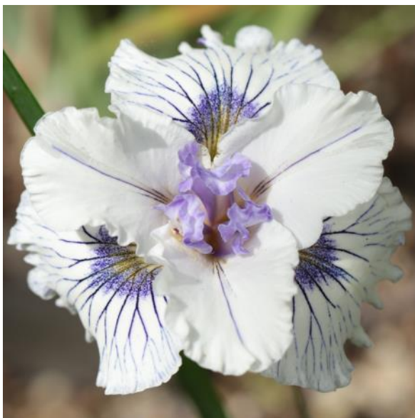
'Big Waves'

WORKER BEE (Joseph Ghio, R. 2018) Sdlg. SP-134M2, 16" (41 cm), ML, S. gold, washed and lined brown; style arms gold; F. gold, diffuse cream signal, brown lines radiating out to near solid deep brown band, thin cream halo around band. Patchen Pass X QP-102K2, Earmark sib. Bay View 2018.