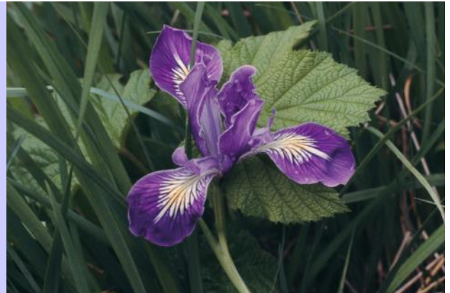
I. tenax, Neahkahnie Mt