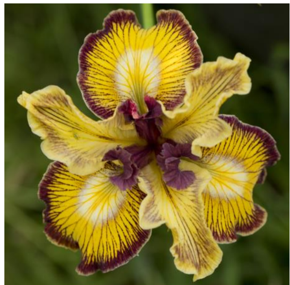
'Worker Bee'