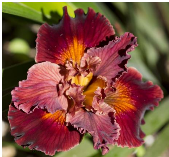
'Take the Red Eye'