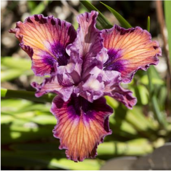
'Columbia Street'