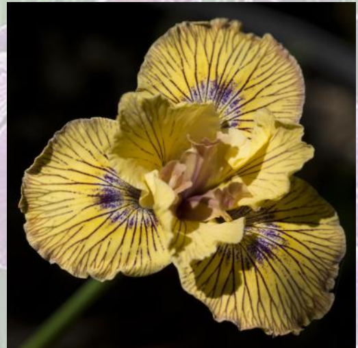
'Pony Up'