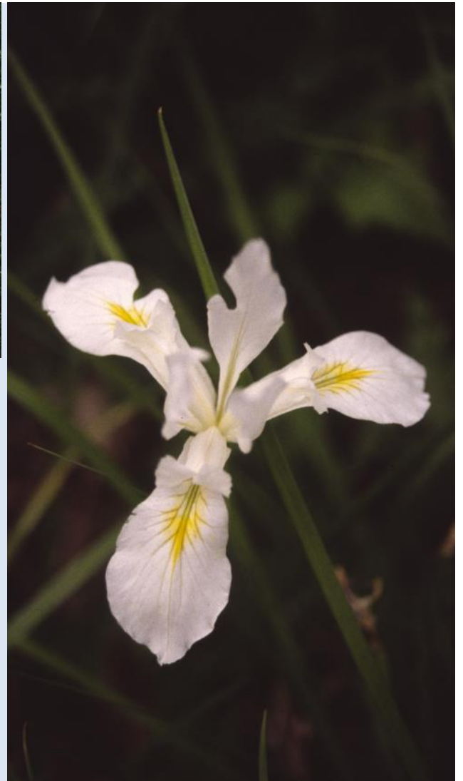
I. tenax , Rigby, Napavine

While gormanii is merely a variety of the species, the other yellow I. tenax is a full subspecies: I. tenax ssp. klamathensis . It demonstrates most, but not all expected characteristics of the species. A particularly unexpected trait is that it grows in a very small location in California rather than in Oregon or Washington. Lewis and Adele photographed it at this location, Orleans in northern California.