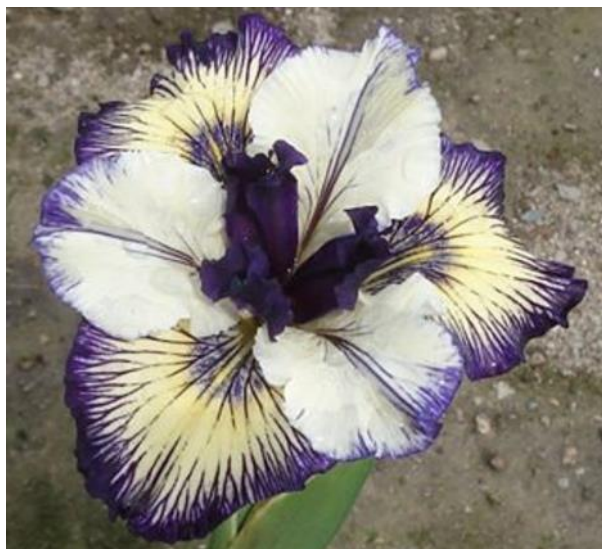
'Eye of the Hurricane'