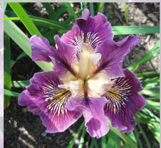
'Toe Tapper'