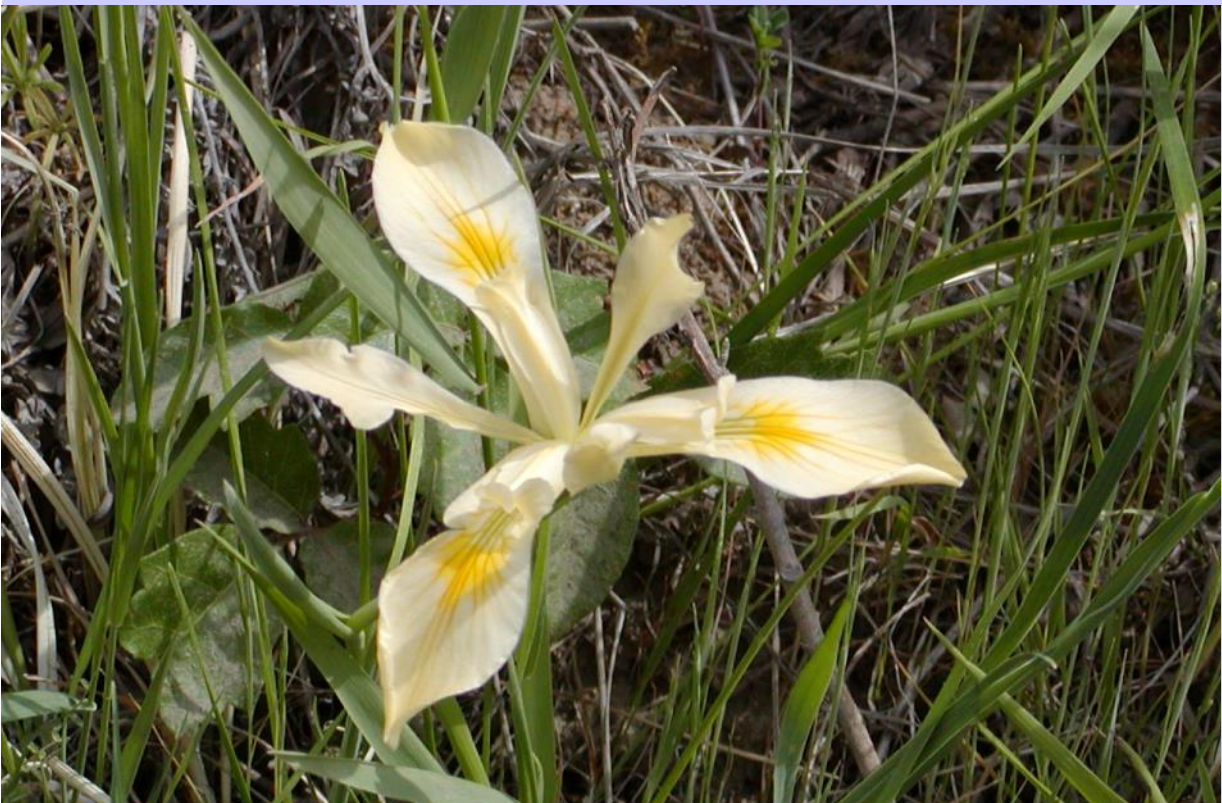
I. tenax var. gormanii, Henry Hagg Lake