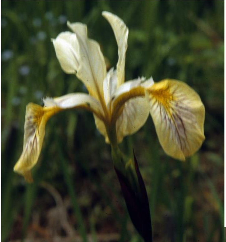
'Crimson Accent' is a Cal-Sibe, from a cross between the whiteflowered Iris sanguinea 'Snow Queen' and yellow-flowered I. innominata.

I. sanguinea is known for red bracts, except in this white selection, so it is interesting to see that the bracts are red in the progeny, hence the name 'Crimson Accent.'