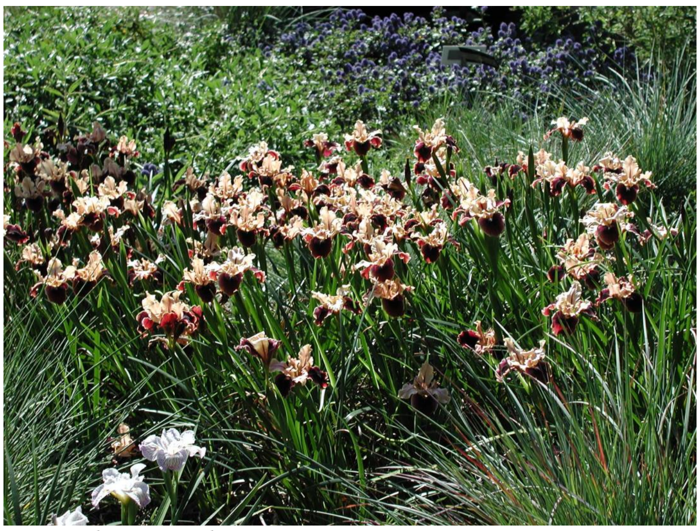
Spring 2014 Volume XXXXII Number 2