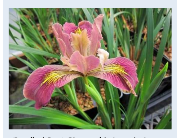
'Broadleigh Rose'

www.auldenfarm.co.uk/pacificcoastiris.html Several PCI seedlings; many other plants