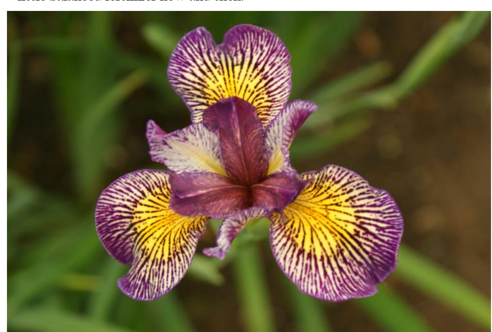
Lorena Reid's Cal-sibe 'Stitch Witchery', a cross between PCI 'All Shook Up' and Iris chrysographes.

The Siberians are divided into two groups.