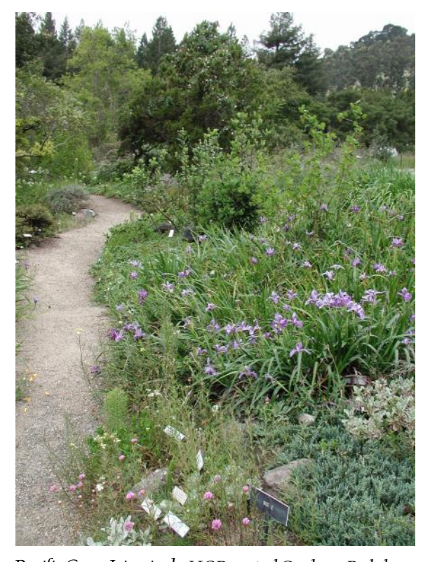
Pacific Coast Irises in the UC Botanical Garden at Berkeley

This is a great way to share your photographs and to make the wider Iris world aware of the beauty of Pacific Coast Native Irises.