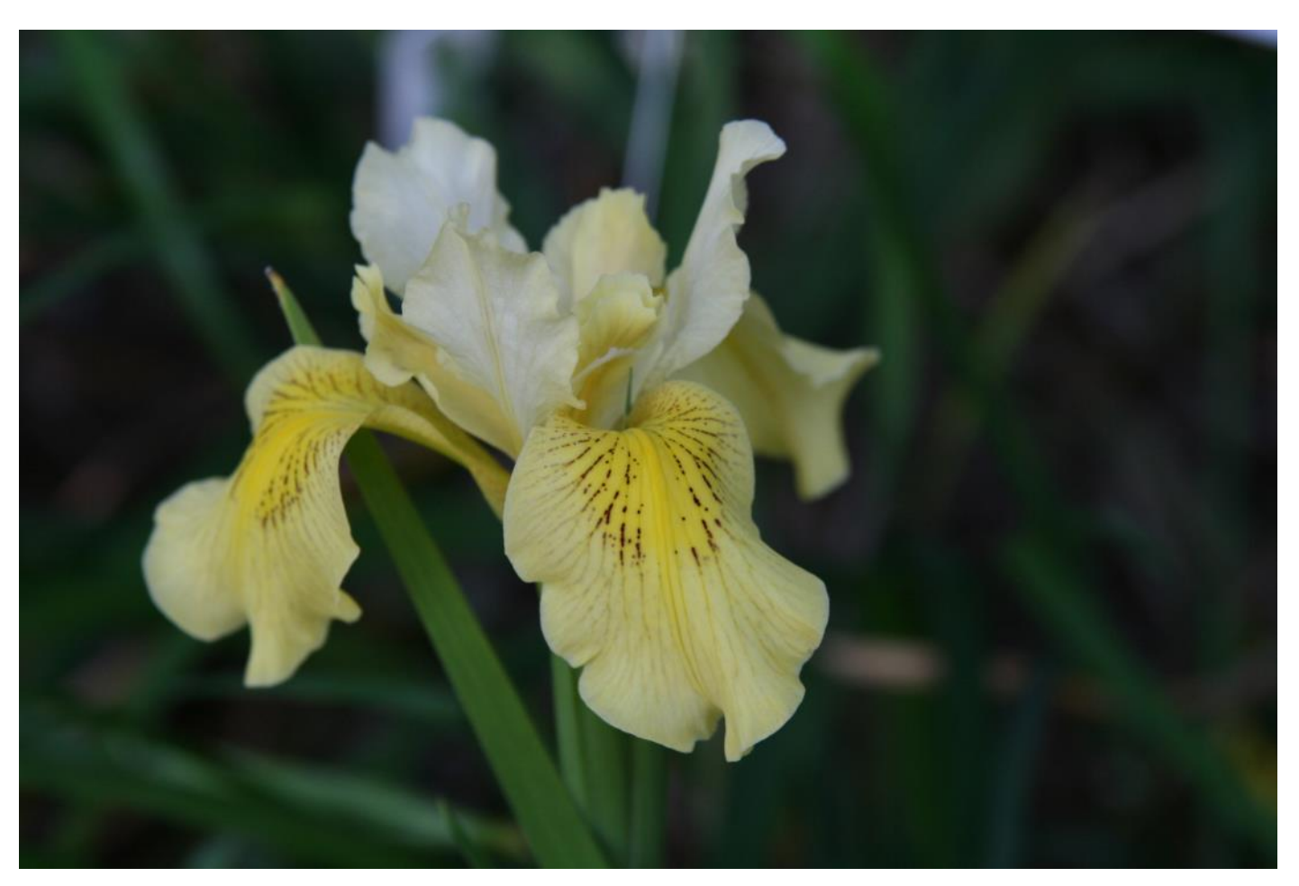
Cal-Sib 'Lyric Laughter'