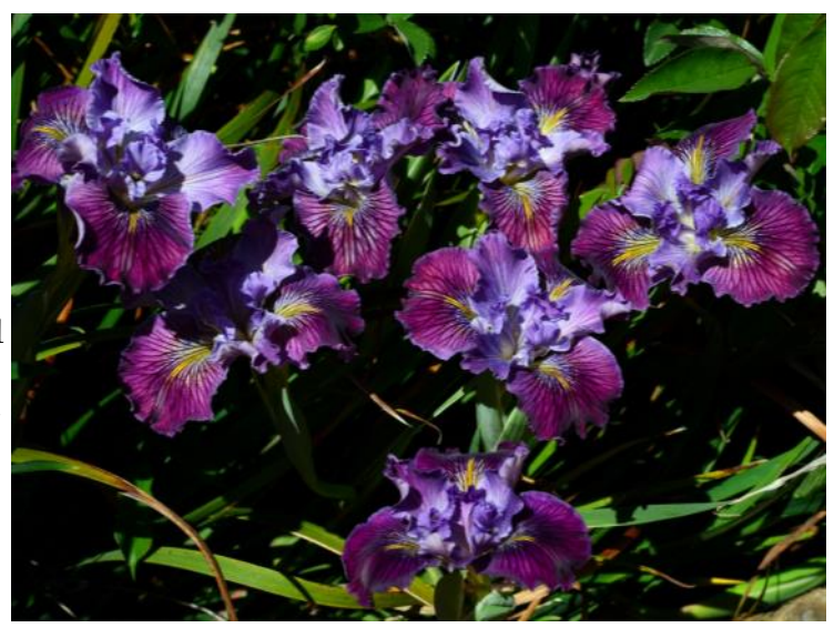
A 2013 John Taylor seedling

The seeds have now been sent on to Louise, and will be available for the next seed exchange in late fall 2014. Thanks to Diane's determination to figure this out, we know how to successfully ship seeds into the US, at least some of the time: Write the final address (SPCNI's official mailing address, which will be in the packet of materials you get from me) on the outside of the envelope, cover it with the customs label, well-taped on, and make sure all the required paperwork and listed seeds are inside. Oh, and don't forget to include the spare mailing label to SPCNI inside, just in case customs staff follow their own instructions.