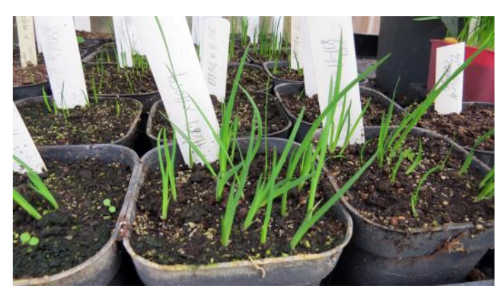
This season's crop of seedlings, germinating in the editor's glasshouse

Read the section on Seed Ripening, Collecting, et cetera, on our website at <a href="http://www.pacificcoastiris.org/gardeniris">http://www.pacificcoastiris.org/gardeniris</a> handlingseeds.html for more information on how to clean Pacifica Iris seeds. It's easy, it's fun, and it helps SPCNI offer more Pacifica Iris seeds in our sale than any other iris seed inventory in the world.