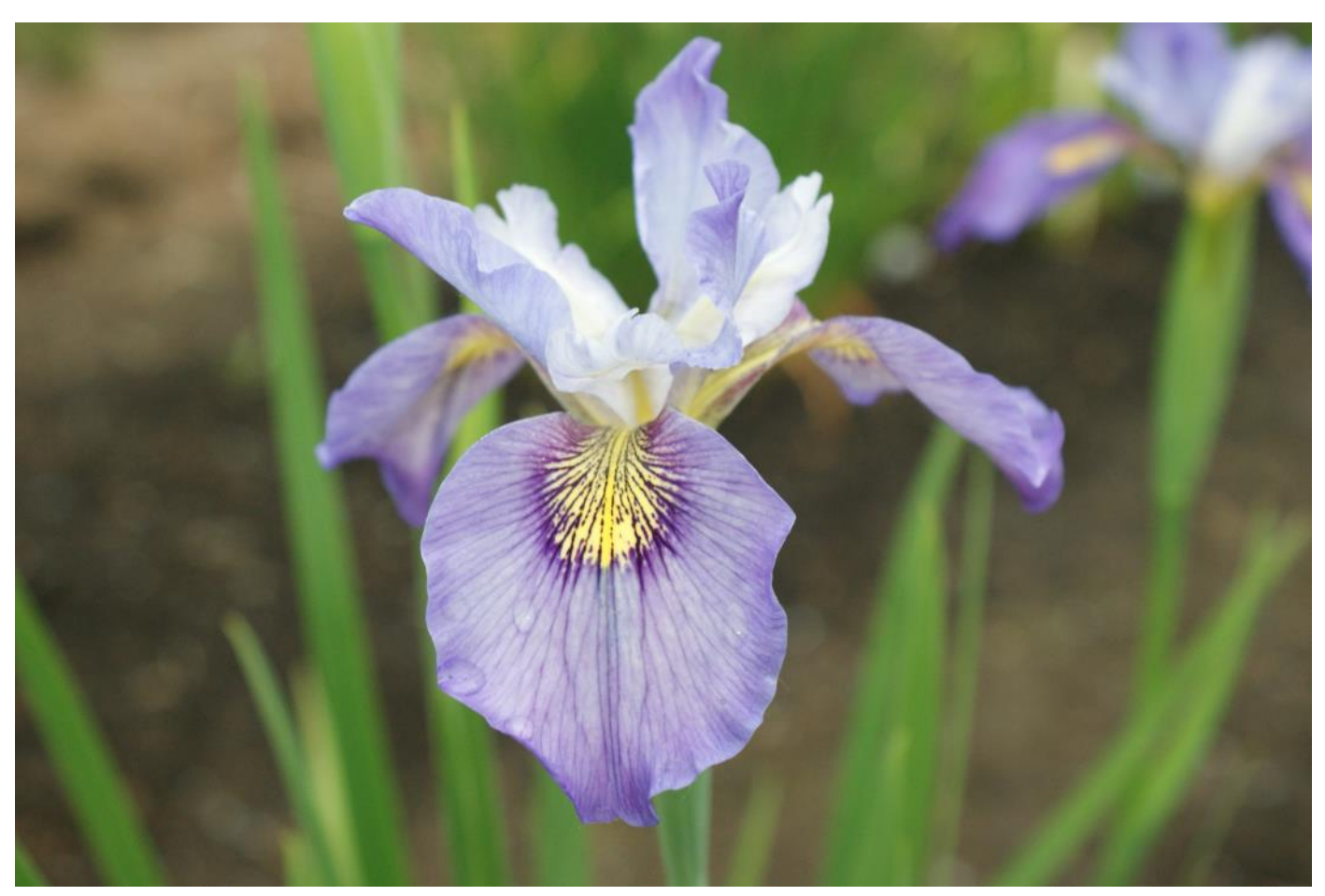
Lankow's Cal-Sib seedling 08CS-018-C