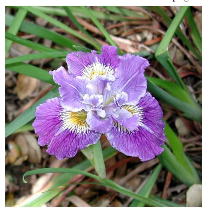
Iris douglasiana hybrid

It formed in 1974 when volunteer docents started propagating plants for sale, the proceeds going towards the botanical gardens operations. Currently, we have over 100 active volunteers and staff members in our program.