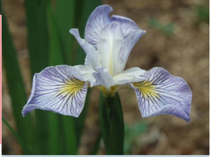
'Fauxmo' is a Cal-Sibe cross, (((I. forrestii x I. chrysographes) x Craig's Blue-Eyed White (aka Briarcup) which is also described as (I. douglasiana x unknown)). It has the appearance of I. missouriensis, but tolerates dry summers and acid soils of Seattle, WA better than this species, hence the name.

When I was making a lot of Cal-Sibe crosses, I obtained a number of seedlings with which I was well pleased: 'Fine Line', 'Lyric Laughter', and 'Golden Waves'. This last went to England where it won a High Commendation from the Royal Horticultural Society. My most current registration, 'Fauxmo' [false missouriensis], with blue and white stripes, is a good substitute for I. missouriensis , which does not take kindly to Seattle's climate. It needs hotter summers and alkaline soil.