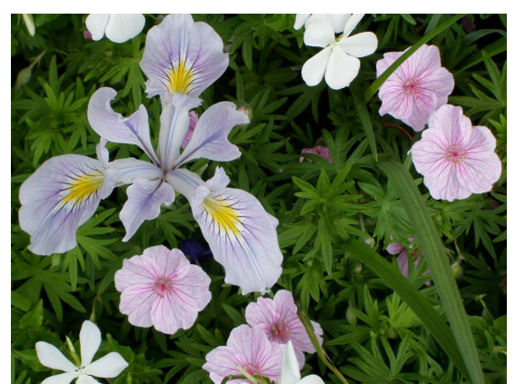
Liselotte Hirsbrunner's #1

Visitors selected some of the same photographs for their "People's Choice" awards. In the Landscape photograph category, Bob Sussman's photo (#2) of an Iris tenax clump at Hagg Lake, Oregon, and Liselotte Hirsbrunner's photo (#1) of Pacifica hybrids in her Swiss garden tied for first place. Liselotte's Pacifica hybrid photos earned First (#5) and Second Place (#3) awards in the Individual Flower category.