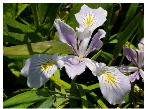
Liselotte Hirsbrunner's #5