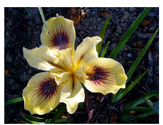
Liselotte Hirsbrunner's #3