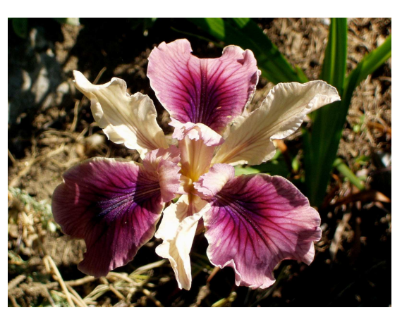
Liselotte Hirsbrunner's #4