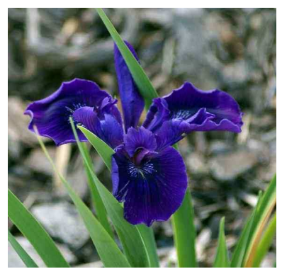
(Pacific Miss x Eyes Have it) x ( I. munzii hybrid x garden hybrid)