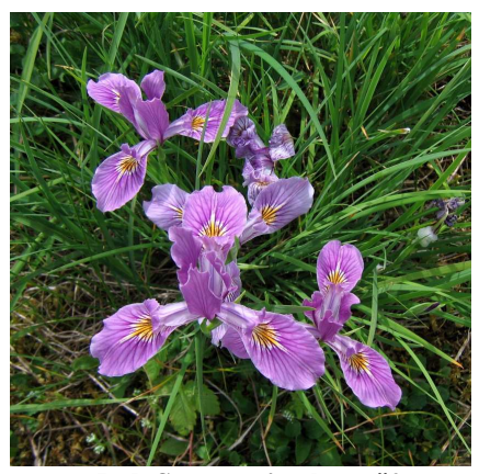
Bob Sussman's photo #2