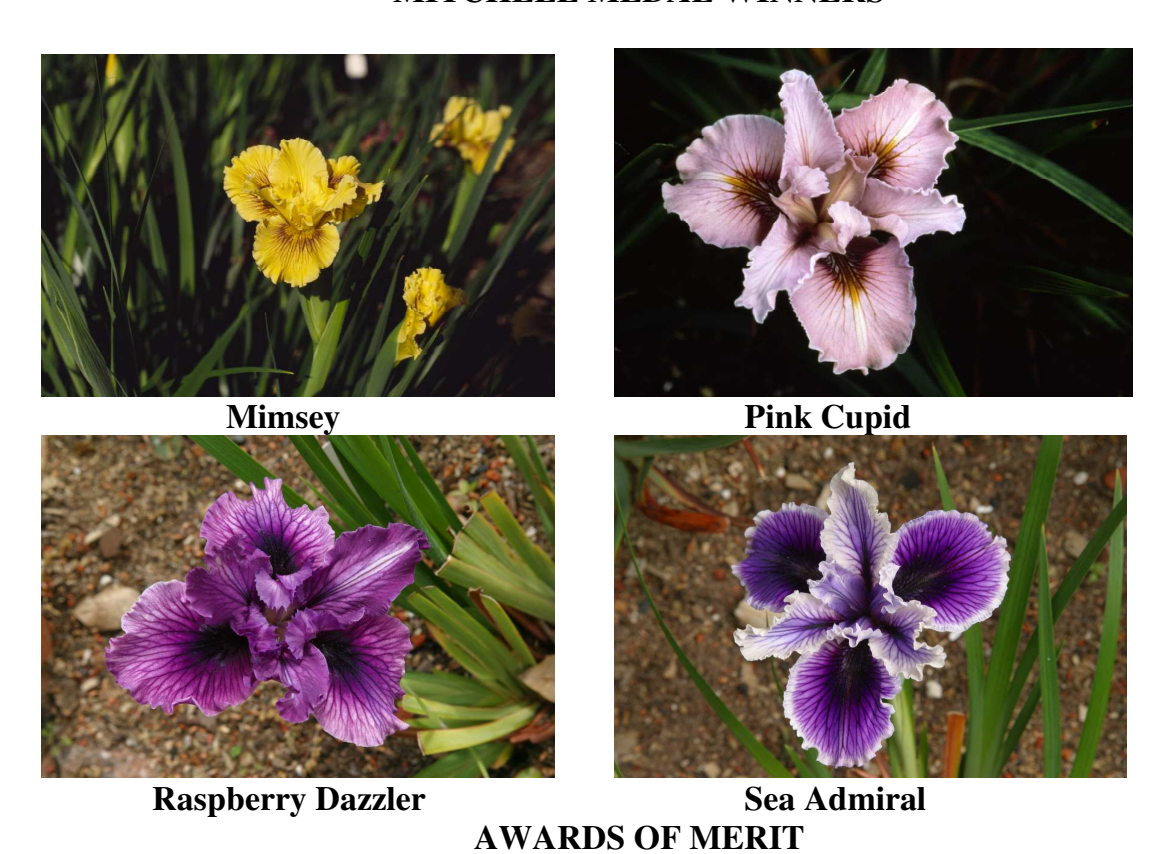
Spring 2008, Volume XXXVI, Number 2