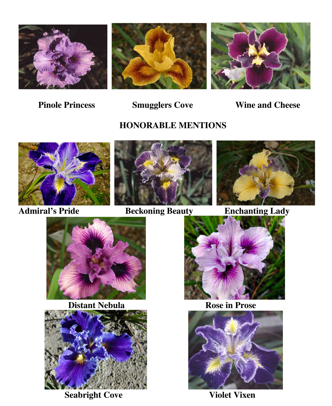
PACIFICA IRIS ONLINE PHOTO CONTEST